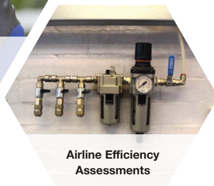
Airline Efficiency Assessments